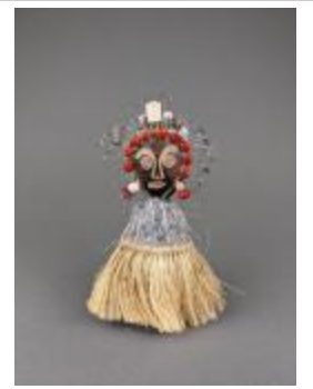
Yagua Doll with Straw Dress and Beads (FR123)