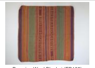
Peruvian Wool Blanket (FR135)