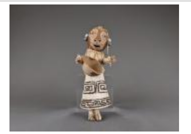
Yagua Doll with Bowl (FR121)