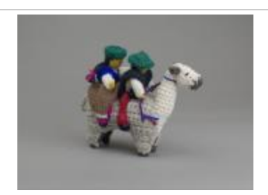
Yarn Llama and Family (FR136)