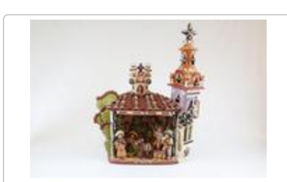
Peruvian Church with Multiple Small Figures (SE53)