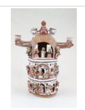
Peruvian Church Candle Holder and Luminary (SE52)