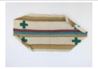
Small Andean Wool Blanket (FR133)