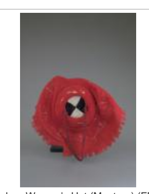
Quechua Women's Hat (Montera) (FR127)