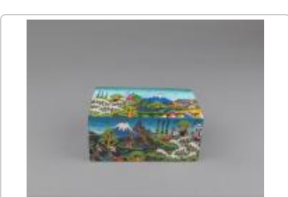
Peruvian Painted Box (FR137)