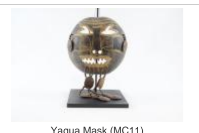
Yagua Mask (MC11)