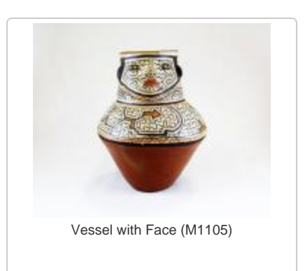
Two Brown Gourds that Open to Nativity (M1547)