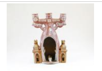
3 Candle Candelabra Nativity (M1072)