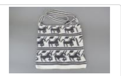
Black and White Horse Pattern Bag (FR130)