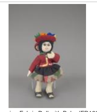
Peruvian Fabric Doll with Baby (FR126)