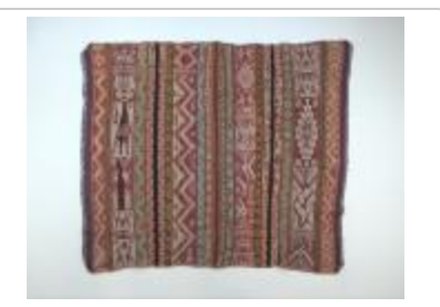
Andean Blanket with Animals (FR134)