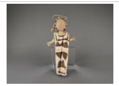
Yagua Doll (FR120)