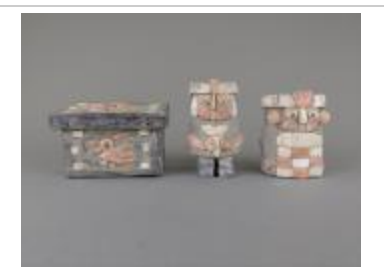
Peruvian Wood and Stone Box and Cup (FR119)