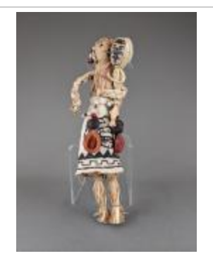
Yagua Doll with Child (FR122)