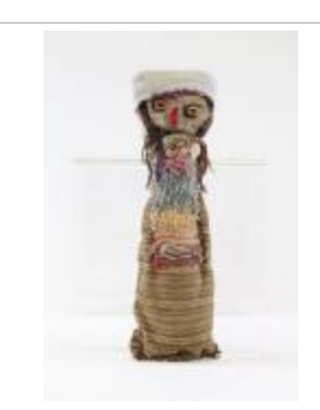
Chancay Doll, Mother and Child (MC7)