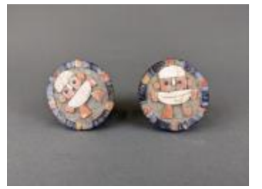
Peruvian Wood and Stone Ear Gauges (FR118)