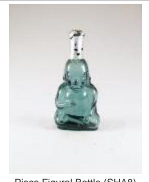
Pisco Figural Bottle (SHA8)